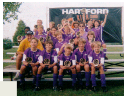
Great job boys!

Congratulations to our U13Boys Panthers who placed 1st at the Hartford Kick Some Grass tournament and 2nd at the New Berlin Fall Classic tournament this past fall.